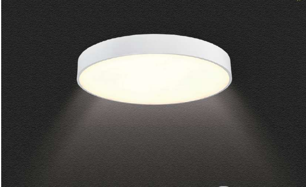
WHIRL PRO- C