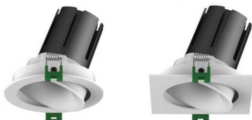
AVIOR 8RA / 10RA