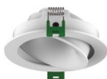
AVIOR 8SA / 10SA